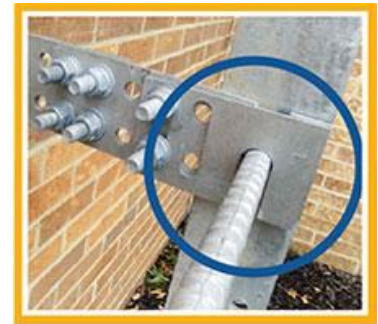
3 Secure with bolt-on capture plate