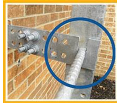
2 Place rung in bracket