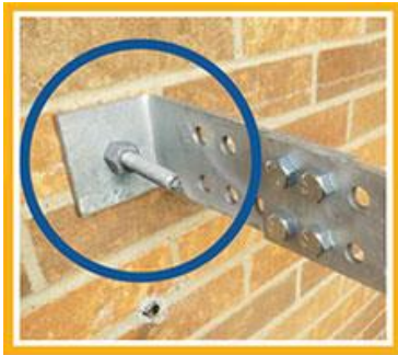
1 Attach Mounting Brackets