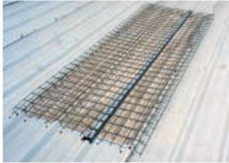
Patent No. 5,419,090

The Model F FALLGUARD® Skylight Screens PREVENTS falls through corrugated fiberglass (CF) skylights. They are simple to install and will prove to be cost effective in view of the exposure in time and dollars expended as a result of a fall through a CF skylight. Being at the same level and having the same profile as the corrugated metal roof panels, they are at times difficult to detect by persons on the roof.