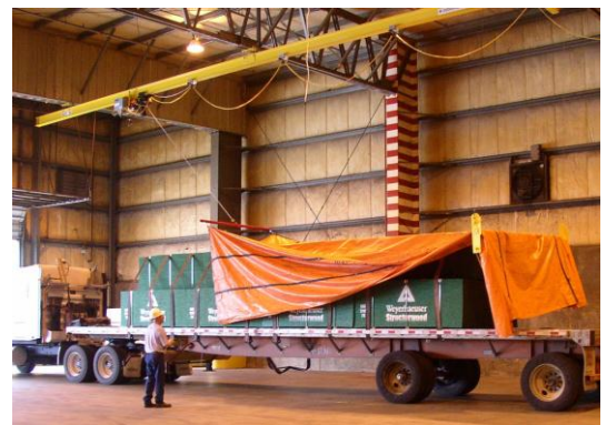
A worker operates an easy to use automated tarping system to safely cover his truck load