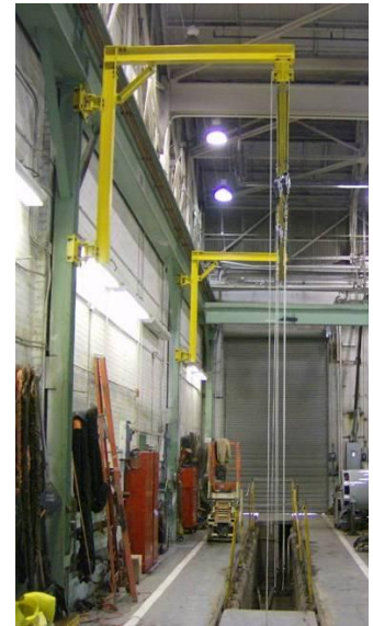
A rigid system designed with fold-a-way capabilities provides flexibility in this truck maintenance facility

We are a complete turnkey provider of fall protection systems designed for the Utilities and Energy industry and have the years of design and installation experience in this market sector. Contact us for expert assistance with your fall arrest, fall restraint and fall protection safety requirements.