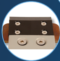
FRONT END STOP ASSEMBLY