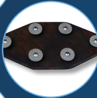
RAIL JOINT ASSEMBLY